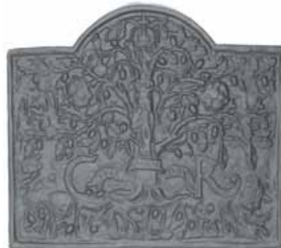
K22L Royal Oak Large £1259.00 - 42.25" x 33" 192kg