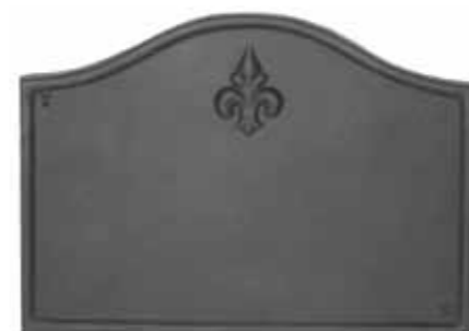
K43F Plain Fleur de Lys £165.00 - 23" x 17" 21kg