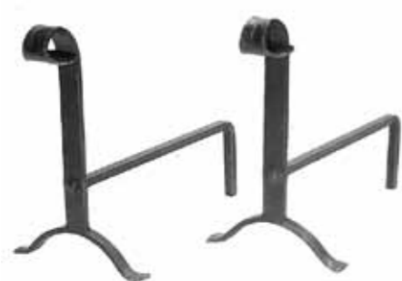
G30 Scroll Dogs Medium £225.00 - Cross Bar H 6.25" w10.25" d20.25" h17.25" 6kg