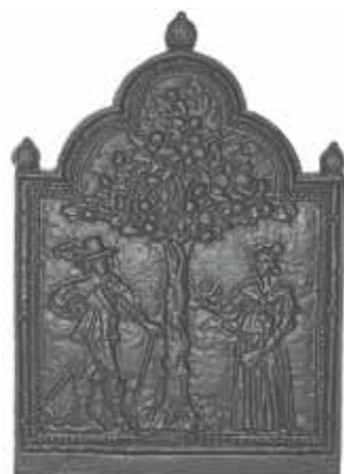
K9 Tree of Life £230.00 - 19.5" x 28.75" 35kg