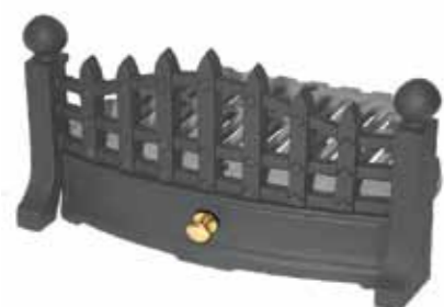
G11 Windsor 16" £95.00 - 5kg fw16" bw9.5" o/ad11" o/ah8.75" Replacement Grid - £43.95