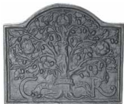
K22 Royal Oak £730.00 - 33.5" x 28.75" 118kg