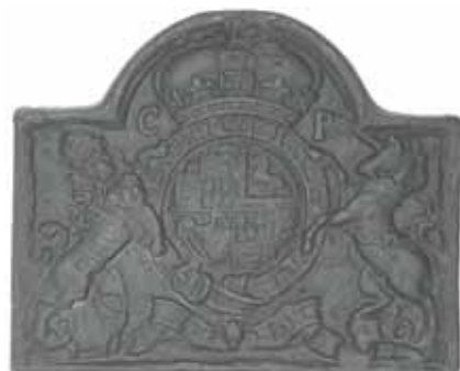
K4 Large Lion & Unicorn £1040.00 - 39" x 31" 167kg