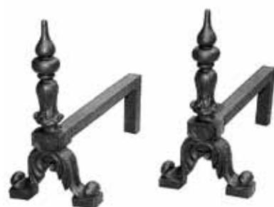
G36 Pinnacle Dogs (Cast Iron) £140.00 - Cross Bar H 6" w7.7" d19" h16" 19kg