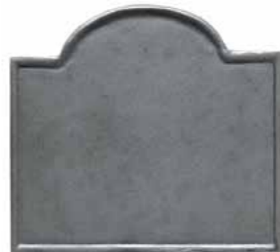
K6P Plain Fireback £250.00 - 24.25" x 20" 48kg