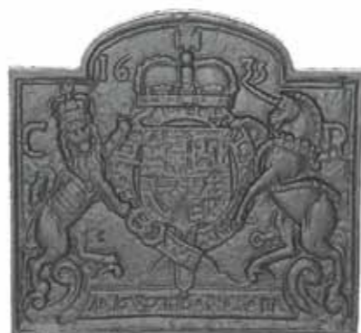
K6 Coat of Arms 1635 £250.00 - 23.5" x 20" 35kg