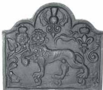
K13 Laughing Lion £475.00 - 29" x 26" 71kg