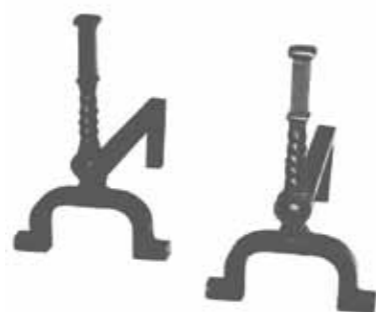
G40 Barley Twist Dogs (Cast Iron) £115.00 - Cross Bar H 6.25" w10" d18.25" h17" 15kg