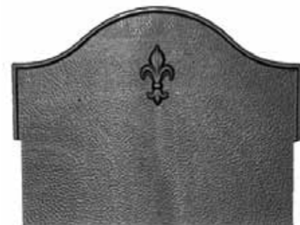
K57F Mini Fleur de Lys £79.95 - 15.5" x 10.75" 9kg

We understand the importance of coming back to a cosy home.