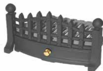
G11 Windsor 18" £98.00 - 6kg fw18" bw11.25" o/ad11.25" o/ah8.75" Replacement Grid - £43.95

Firedogs are used as ornamental supports for Dog Grate/Baskets. Consideration should be given to the extra width required in a fireplace opening to accommodate the feet span of the Dogs.