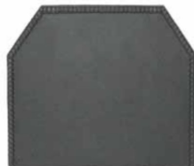
K37 Rope Twist £275.00 - 26.25" x 20" 44kg