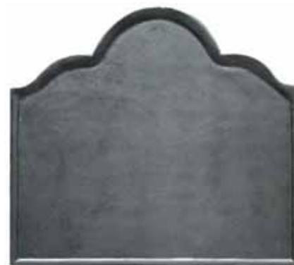
K13P Plain Fireback £465.00 - 29.75" x 26.75" 57kg